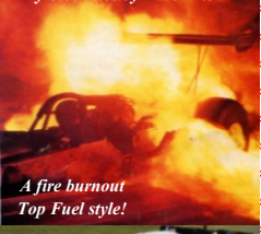
A fire burnout Top Fuel style!