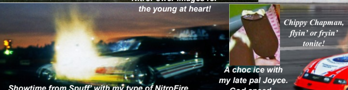
Showtime from Spuff' with my type of NitroFire