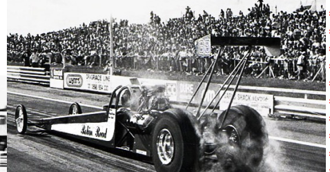
Bring on the NitroThunder!