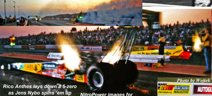
Rico Anthes lays down a 5-zero as Jens Nybo spins 'em up